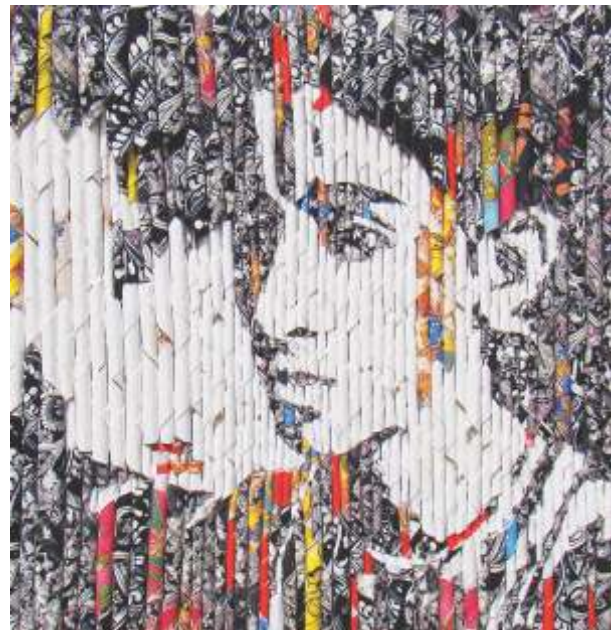
Story teller - III 12" x 12" new media work 2015