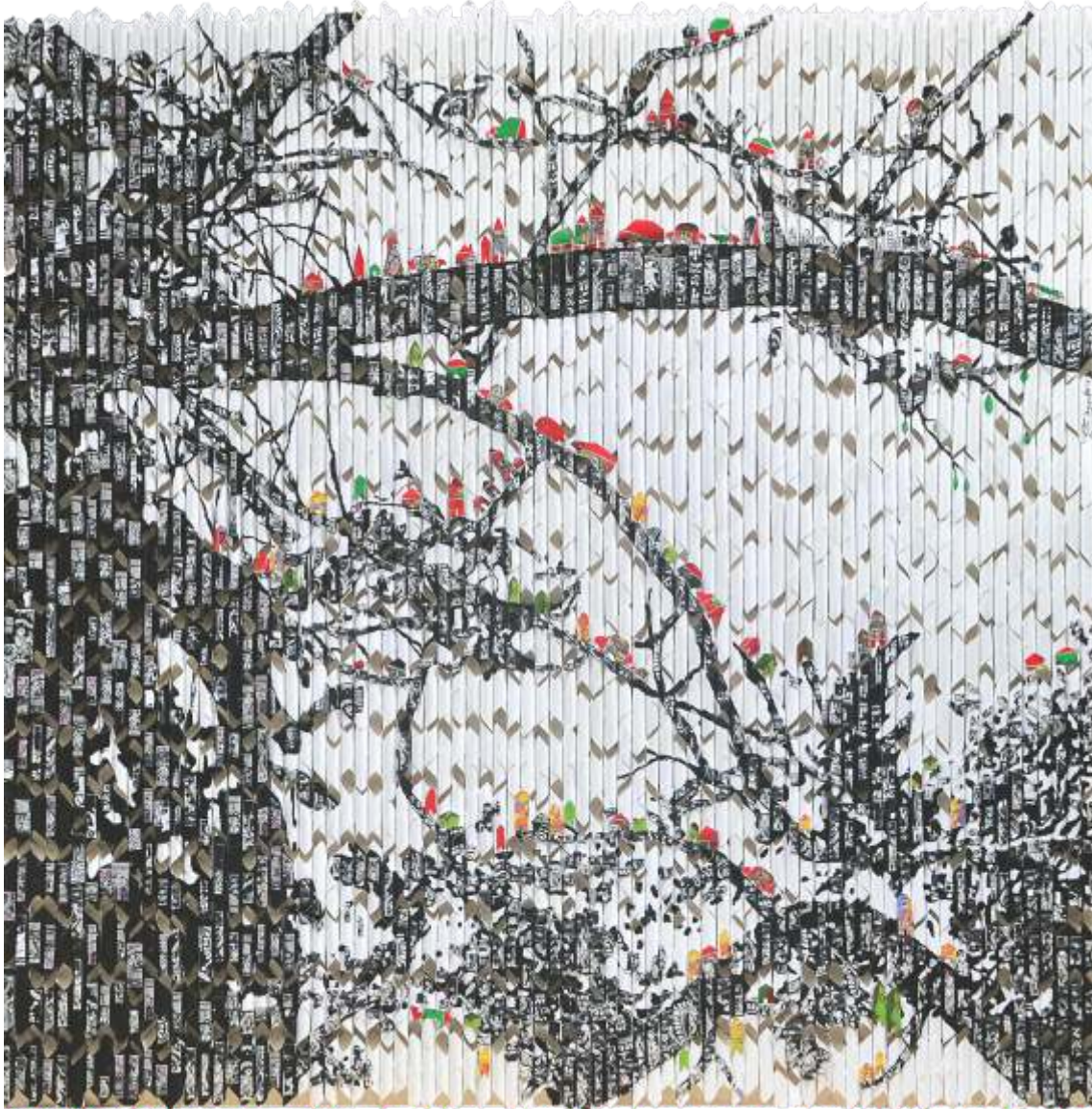
Story teller - I 48" x 48" new media work 2016