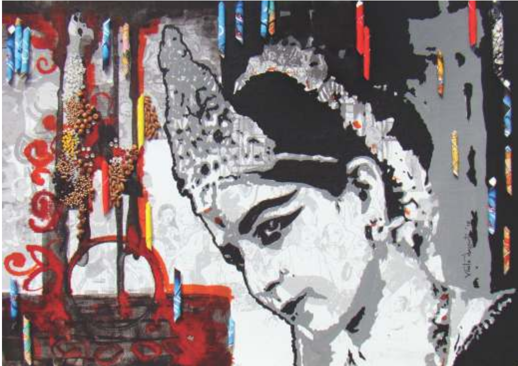
Story teller - XI