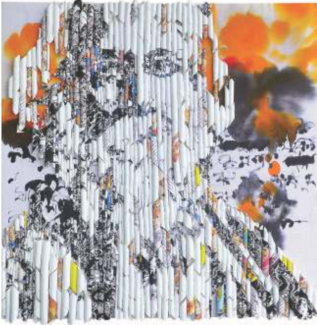
Story teller - IX 21" x 21" new media work 2013