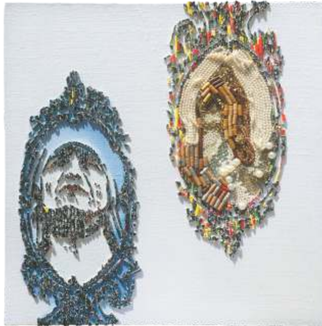
Story teller - X 21" x 21" new media work 2015