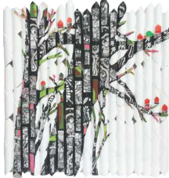
Story teller - IV A, IV B, IV C, IV D