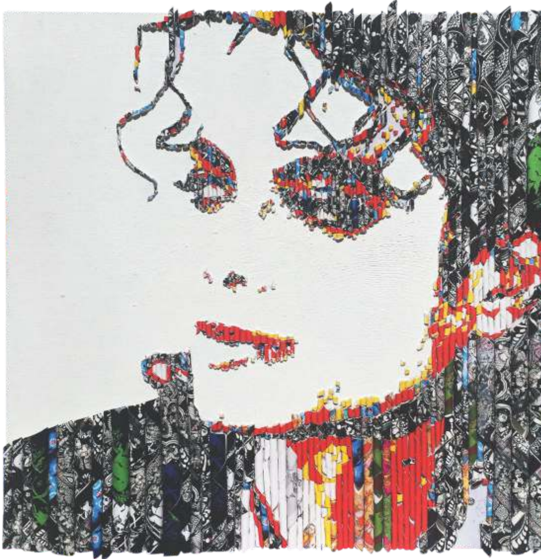
Story teller - VII