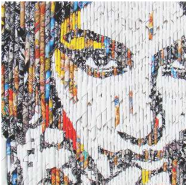
Story teller - II 12" x 12" new media work 2015