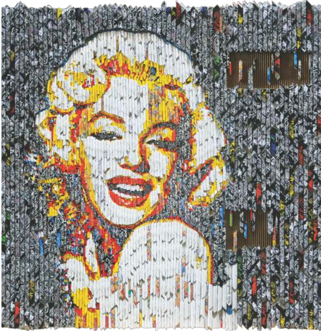
Story teller - VII